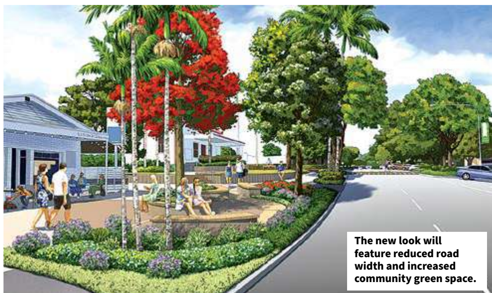
The new look will feature reduced road width and increased community green space.