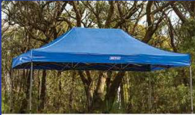
4.5M x 3M GAZEBO