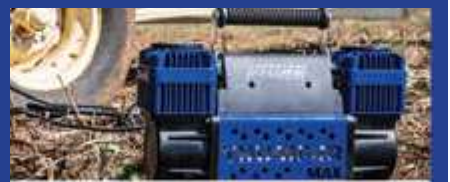
THUMPER MAX DUAL AIR COMPRESSOR