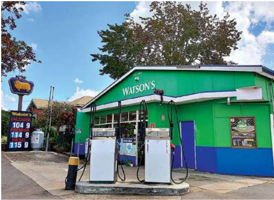
A comment on Facebook asked the owners to "please keep the Golden Fleece sign for the town".