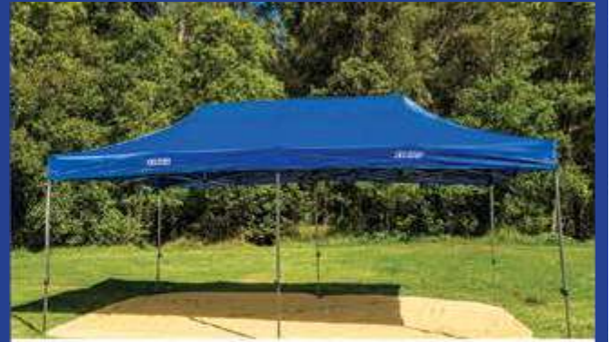
6M x 3M GAZEBO