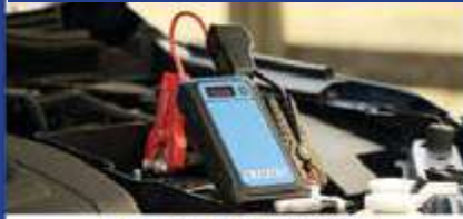
LITHIUM 1000A JUMP STARTER