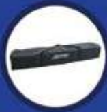
3M x 3M GAZEBO POLYESTER BAG ONLY: $14.95