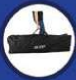
6M x 3M GAZEBO POLYESTER BAG ONLY: $19.95