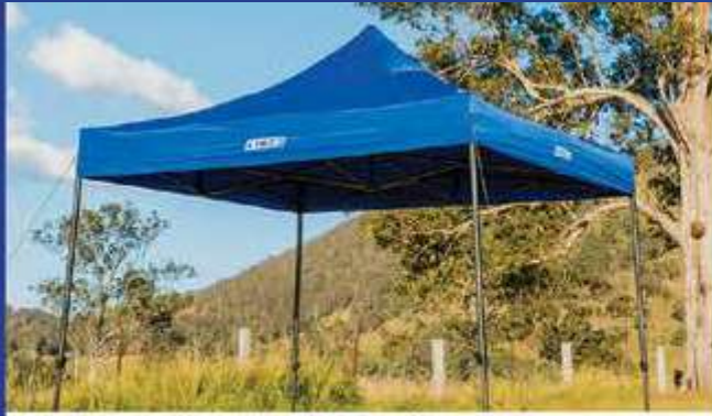
3M x 3M GAZEBO