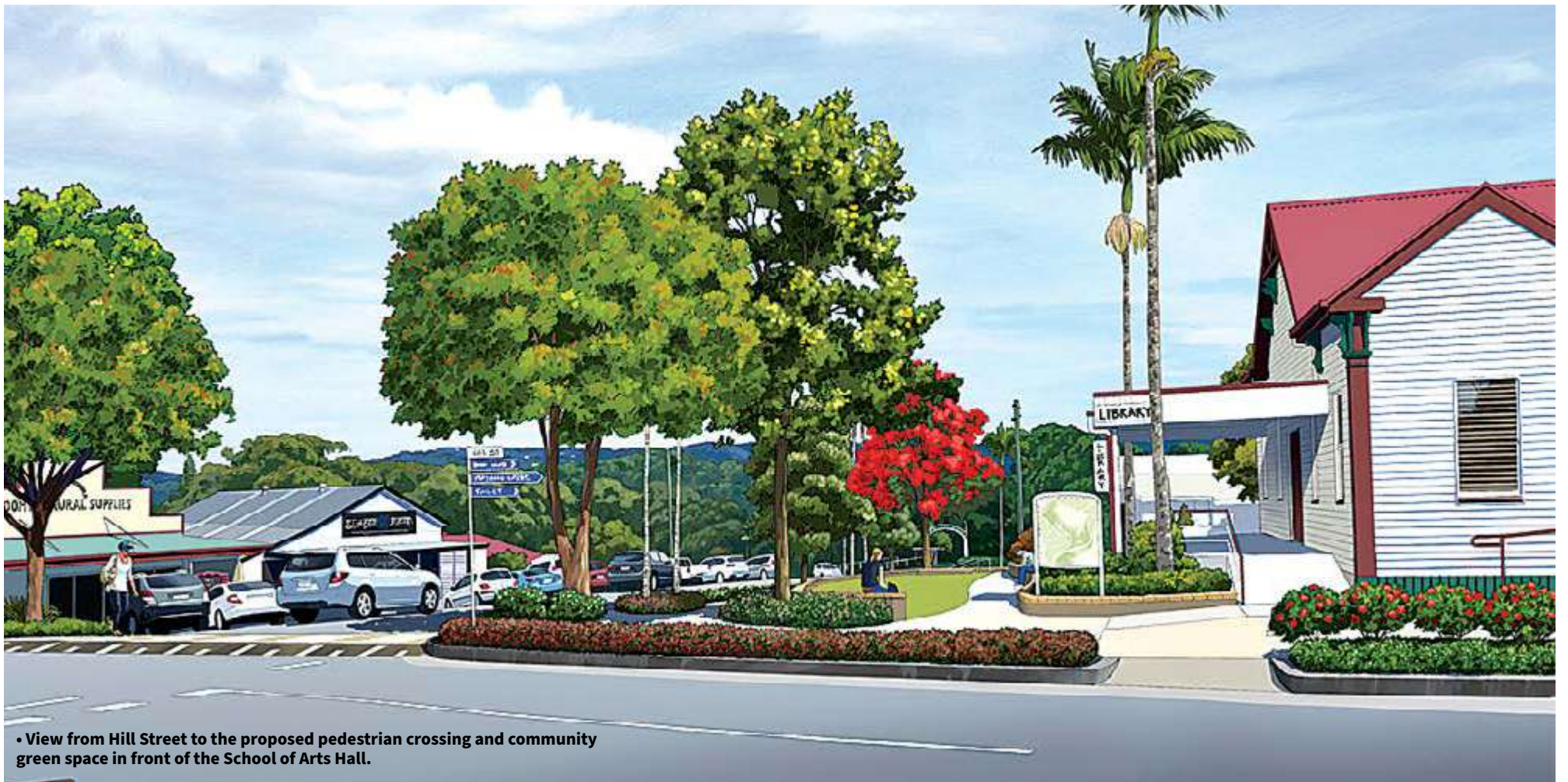
• View from Hill Street to the proposed pedestrian crossing and community green space in front of the School of Arts Hall.