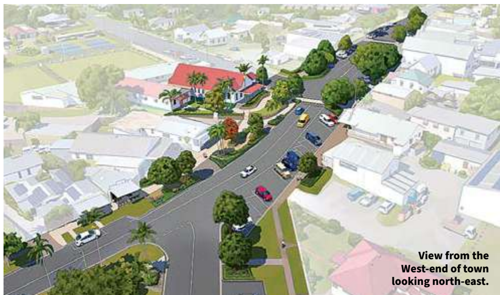
View from the West-end of town looking north-east.