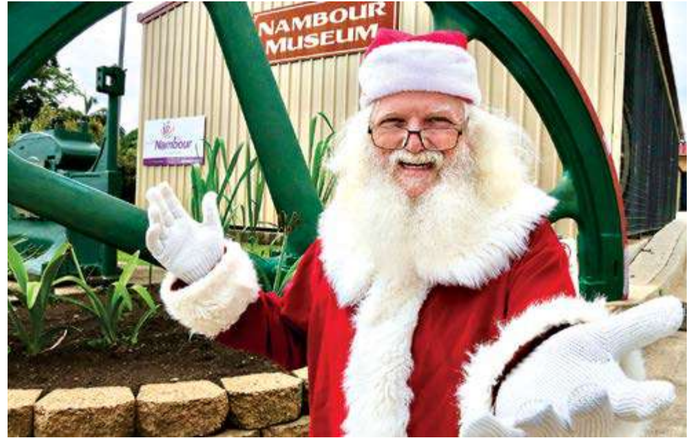
Santa Claus will visit the Nambour Museum on December 2, 9 and 16 from 6.30pm to 8pm.