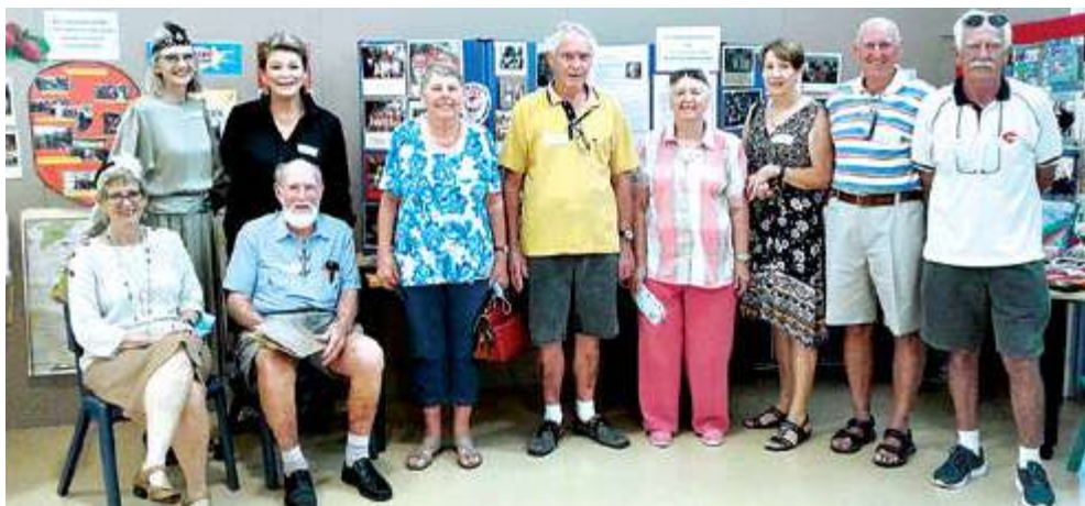
Past students enjoy a trip down memory lane & a delicious morning tea while touring the grounds of Chevallum State School during their Centenary celebrations.