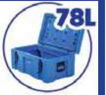
HEAVY DUTY STORAGE BOXES