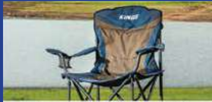
THRONE CAMPING CHAIR