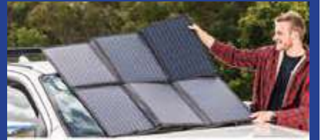
200W SOLAR BLANKET W/ MPPT REGULATOR