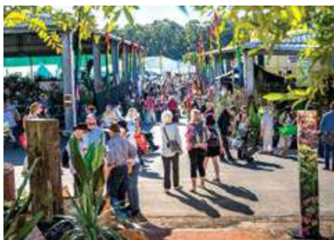
Crowds enjoy the sights at Nambour's Queensland Garden Expo.

To celebrate the Launch of the Adventure Kings Range and their Christmas Catalogue they are hosting an open day with a free sausage sizzle and giveaways on Saturday November 27.